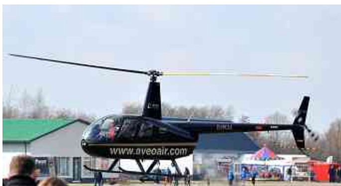
Links: Foto: © Manfred Weber, rechts: Foto: © RevierHeli / AveoAir