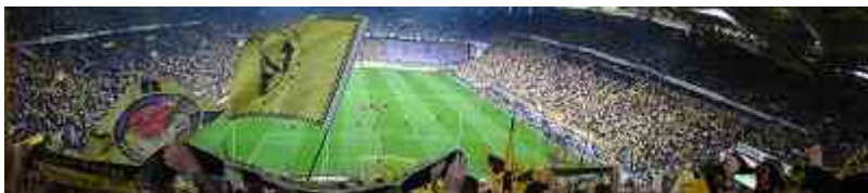
Der Signal-Iduna-Park, Spielstätte des BVB