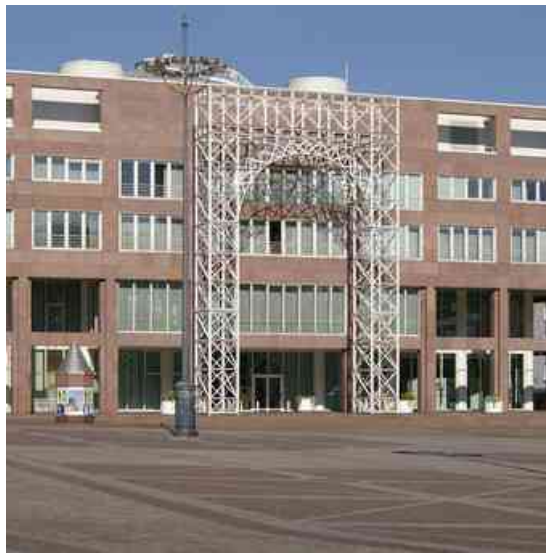
Dortmunder Rathaus / Bürgersaal