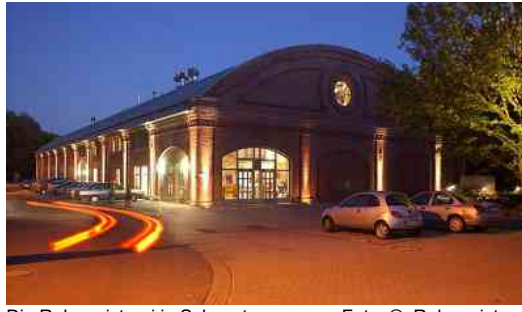
Die Rohrmeisterei in Schwerte