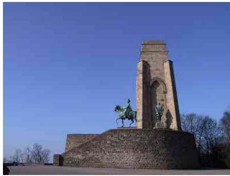
Auf der Hohensyburg

Lunchbreak at the Rohrmeisterei Schwerte.