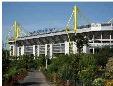
Der Signal-Iduna-Park, Spielstätte des BVB