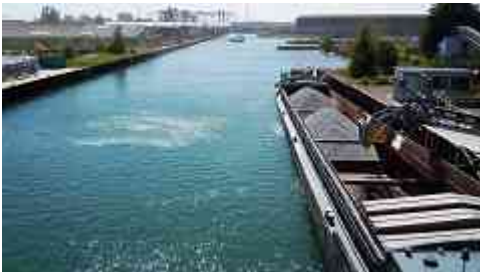
Dortmunder Hafen und ehemaliges Hafenamts

Gemeinsamer Ausflug auf den Spuren der ROUTE INDUSTRIEKULTUR