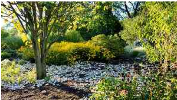
Der Westfalenpark mit dem Florian-Turm